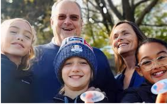
Dr Bob's Spring Sprint