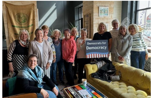
The Women's Coffee Group at the Lake Charlevoix Coffee Company