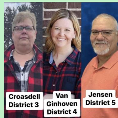
Croasdell District 3